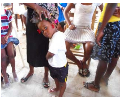
Very shy but very sweet little girl.