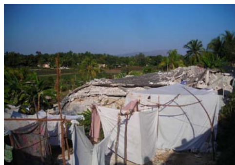
The huge pile of rubble behind the “tents” used to be a church.