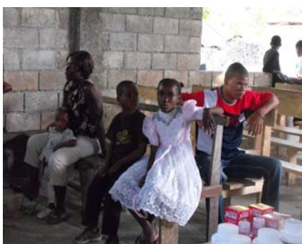
Dressed in her best to see the doctor.