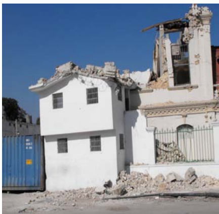
Eighty per cent of the buildings in Leogone are damaged beyond repair.